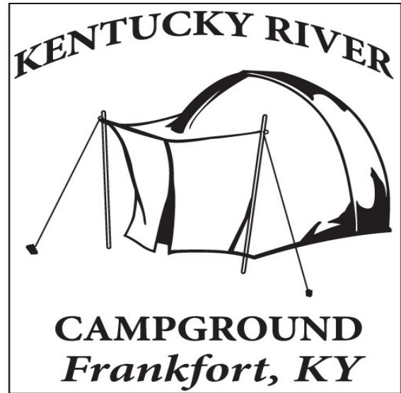
Back of T-shirt